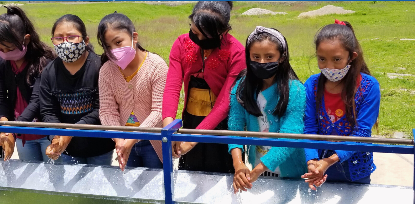
Handwashing station at Betania School